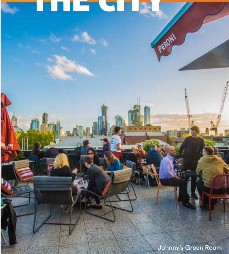
Johnny's Green Room